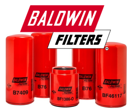
Northern Virginia Supply has your filter needs covered!